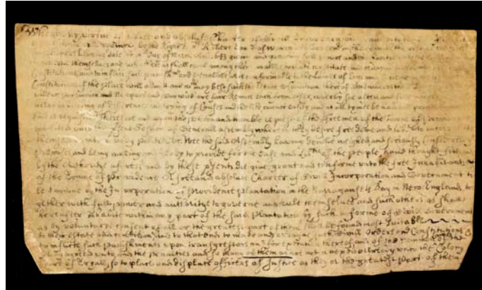
Recently Discovered 1648 Town Charter