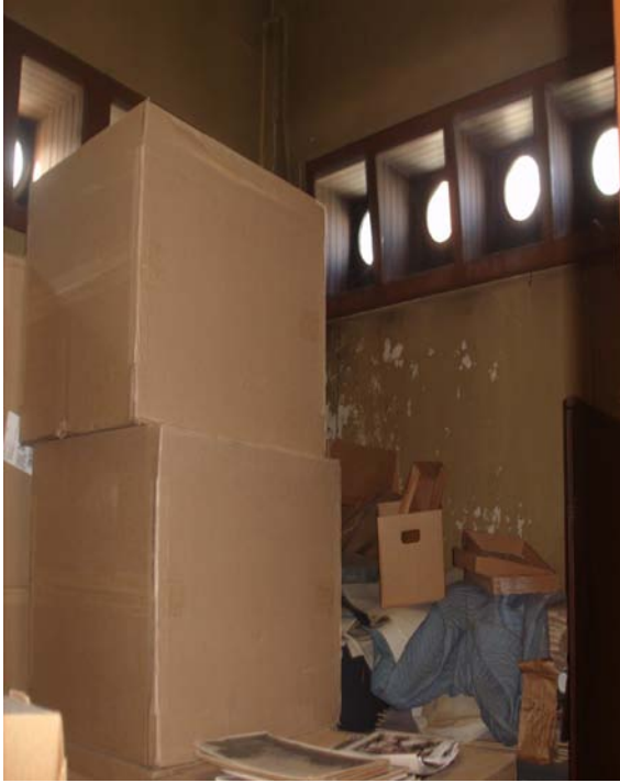
Graphics Room 2010