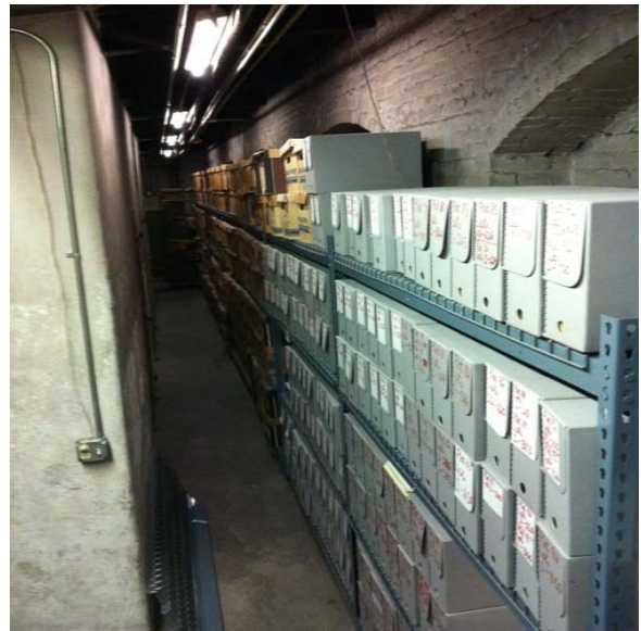
Atrium Storage 2012