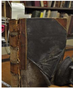
1875 Census Before