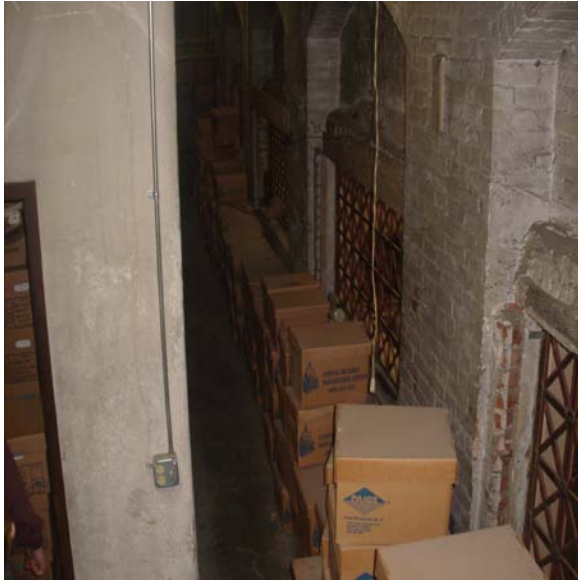
Atrium Storage 2010