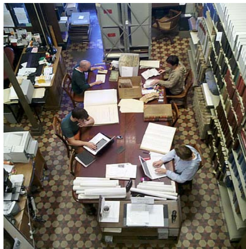
Volunteers at work

The above-mentioned collaborations with the MET School, Providence College and West Bay Collaborative have been mutually beneficial and are expected to continue. In addition, other area colleges have expressed interest in supplying interns and/or work study students to assist the archives. The Archives is also in preliminary discussions with the University of Rhode Island's Graduate Library School with a view towards supplying library school students to assist with