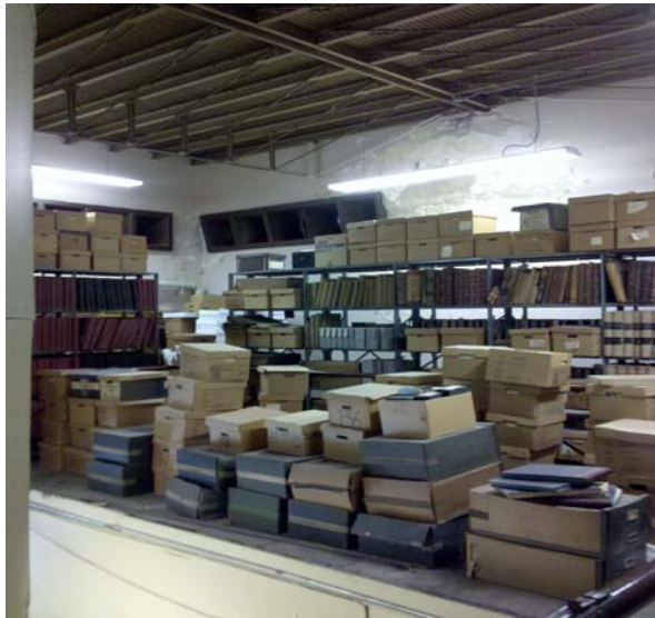
Mezzanine Deck 2010

pursuing the purchase of a dehumidification system designed to stabilize the environment in the archives vault, public research area, as well as the mezzanine and contiguous storage rooms. Controlling humidity levels, however, offers only a partial solution. Optimal conditions require constant temperature and humidity levels (68 degrees F; 50% relative humidity) which would be costly given the present space.