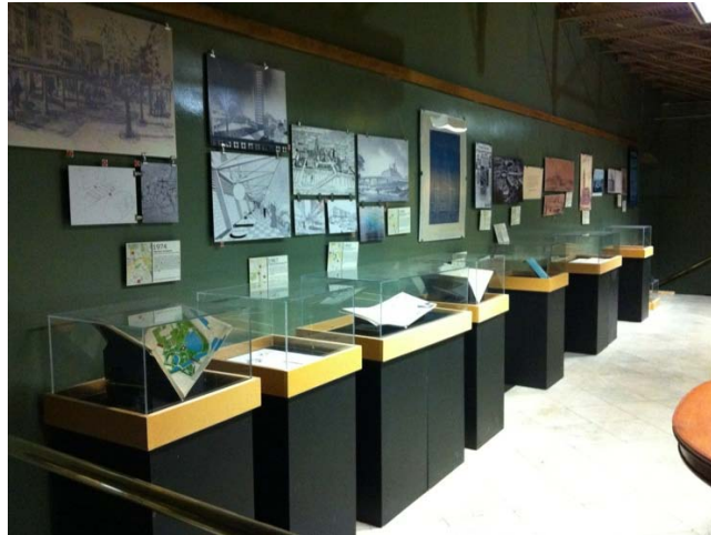
New Archives Exhibit Area

Recently, the lobby entrance to the archives has been transformed into an exhibit area and the “Capital Ideas” exhibit has been re-installed there. Currently, the Archivist is collaborating with Brown University on a new exhibit commemorating Providence’s participation in the Civil War. The exhibit opening is tentatively scheduled for May 2013.