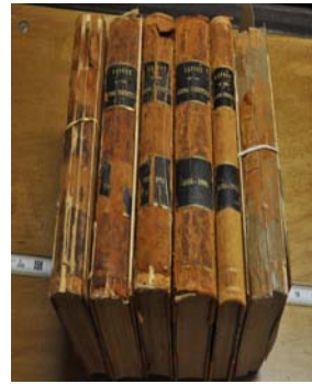
School Reports Before