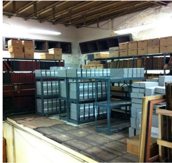
Mezzanine Deck 2012

The inaccessibility of storage areas within the archives was identified as a major area of concern. The Commission noted that several rooms, including the graphics storage area, were so crowded with boxes that entrance into the room was very difficult if not impossible. One “cell” storage room in the Atrium had been locked shut some time ago and the entrance key had been lost. Boxes were scattered about the corridors within atrium storage areas. More than 1,500 boxes of records were stored in basement rooms, some stacked on the concrete floor susceptible to flooding. Water damage was evident to records particularly in the so-called “Assessor’s Room.” Many mayoral portraits were found resting against damp and/or damaged walls along the archive’s mezzanine resulting in damage to canvasses and frames. Boxes lined both walls of the lobby entrance into the archives. In accordance with the Commissions recommendations, the archives staff has: