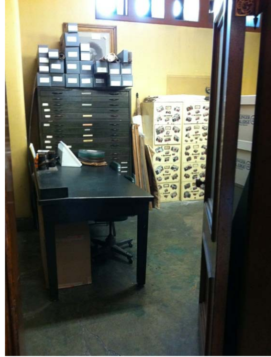
Graphics Room 2012