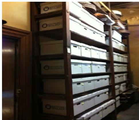
19 th Century Aldermen Records

In addition, major collections of 19 th and early 20 th century City Council and Board of Aldermen records were scattered throughout the archives storage areas and were unavailable for research. During the summer of 2010 the Archivist instituted a program to recruit volunteers to begin processing these important collections. Close collaborations have been formed with the MET School, the West Bay Collaborative, and Providence College. A recent call for volunteers was highly successful, attracting librarians, a retired teacher among others to assist us with various tasks. Currently nine volunteers are working on various projects to improve access to the archives' collections.