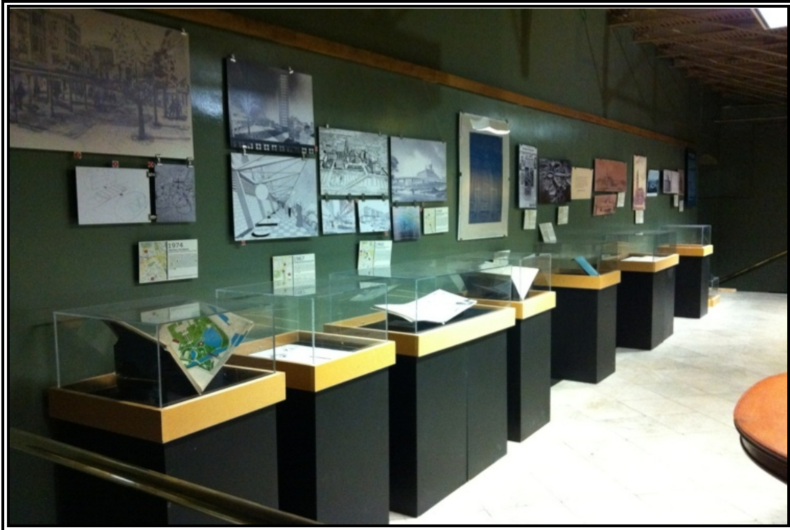
New Archives exhibit Area

marking the 150 th anniversary of the conflict between the North and South. In November, the archives hosted an exhibit of highlights from our collections that was carried out in conjunction with the New England City Clerks Convention held in Providence. Documents from the City Archives also appeared in a special exhibit on the Providence African-American community that was installed in a first floor exhibit area at URI's Downtown campus facility.