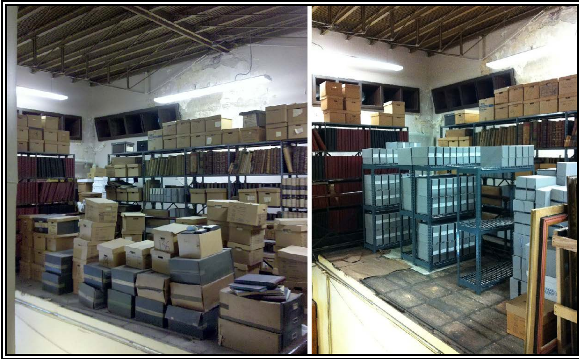
A Before and After of the Upper Mezzanine above the Archive Reading Room

Despite this progress challenges remain. Some time ago archives staff visited the City Engineer's Office on Ernest Street to inventory records there and discovered a basement storage area with large volumes of early plans, correspondence and other material. Nearby, in the Traffic Engineer's Office, a second floor area is filled with an estimated 3,000 sets of early plans and elevations for municipal buildings.