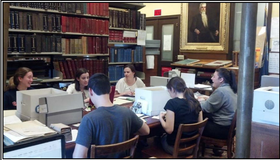
The City Archives has a full house as PC students put in volunteer hours late on a Wednesday evening